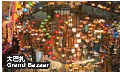
大巴扎 Grand Bazaar