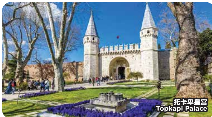
托卡伊皇宮 Topkapi Palace