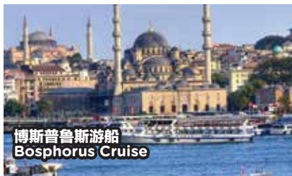
博斯普鲁斯游船 Bosphorus Cruise