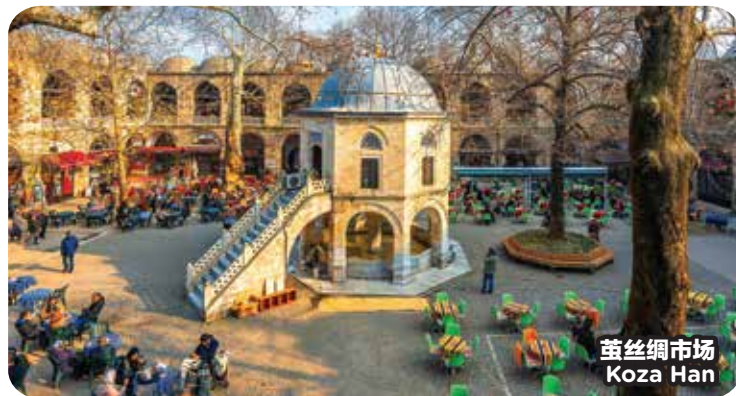
茧丝绸市场 Koza Han

· 倘若原定的景点不对外开放，将由其他景点取代。 · 以上的景点先后顺序可根据具体的情况有所调整。 · 在主要节日，商业展览，旅游旺季期间，住宿酒店可能需要安排在另一个城市。