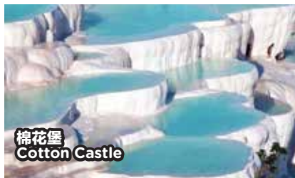
棉花堡 Cotton Castle