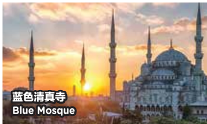
蓝色清真寺 Blue Mosque