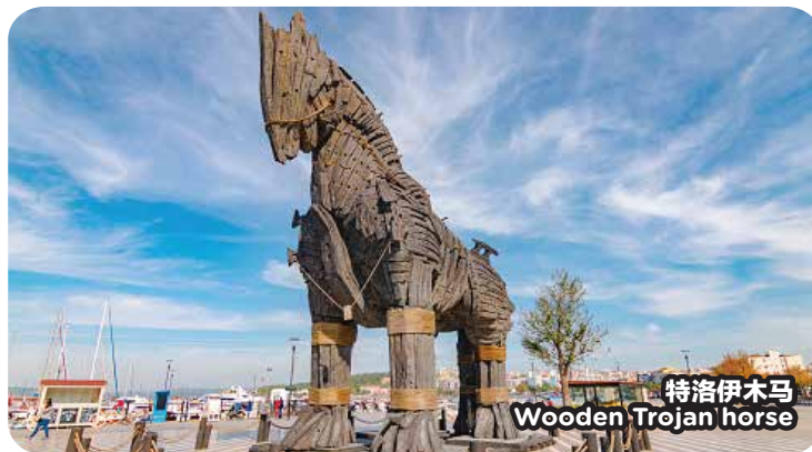
特洛伊木马 Wooden Trojan horse

Arrival Kuala Lumpur with happy memories.