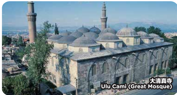
大清真寺 Ulu Cami (Great Mosque)